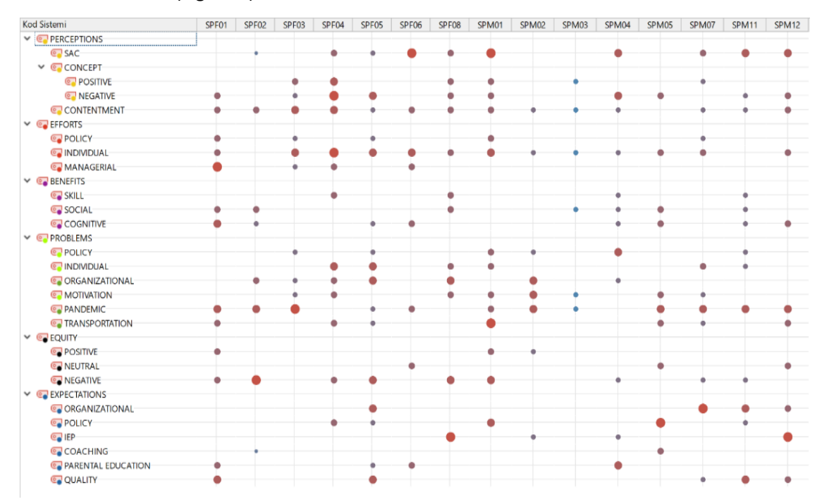
Figure 1: Matrix of Codes

First off, the matrix of codes was prepared. The opinions are gathered under six themes and 23 subthemes (Figure 1).