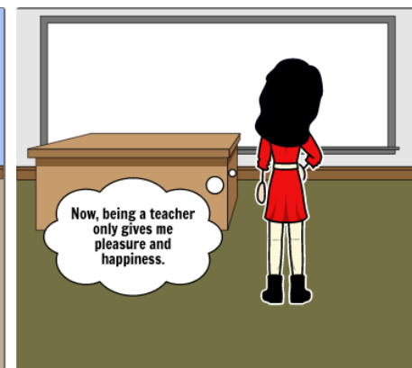
Fig. 1. Storyboard introduction sample

The next preparatory step in the second phase was the design of a rubric to evaluate gamified content. Students were provided several materials such as news articles, sample gamified lesson videos, research articles, and infographics to consolidate the gamification concept. In connection with these materials, they were asked to determine what types of elements must be included in gamified contents and lessons in a form of a rubric they would prepare to evaluate such contents. After the due date, each rubric designed by students was individually reviewed and written feedback was provided for them. As the final product of the assignment, an ultimate rubric based on their ideas and the scientific articles was devised by the facilitator/researcher and posted in the module. Students were informed that their final products would be evaluated in accordance with the finalized rubric.